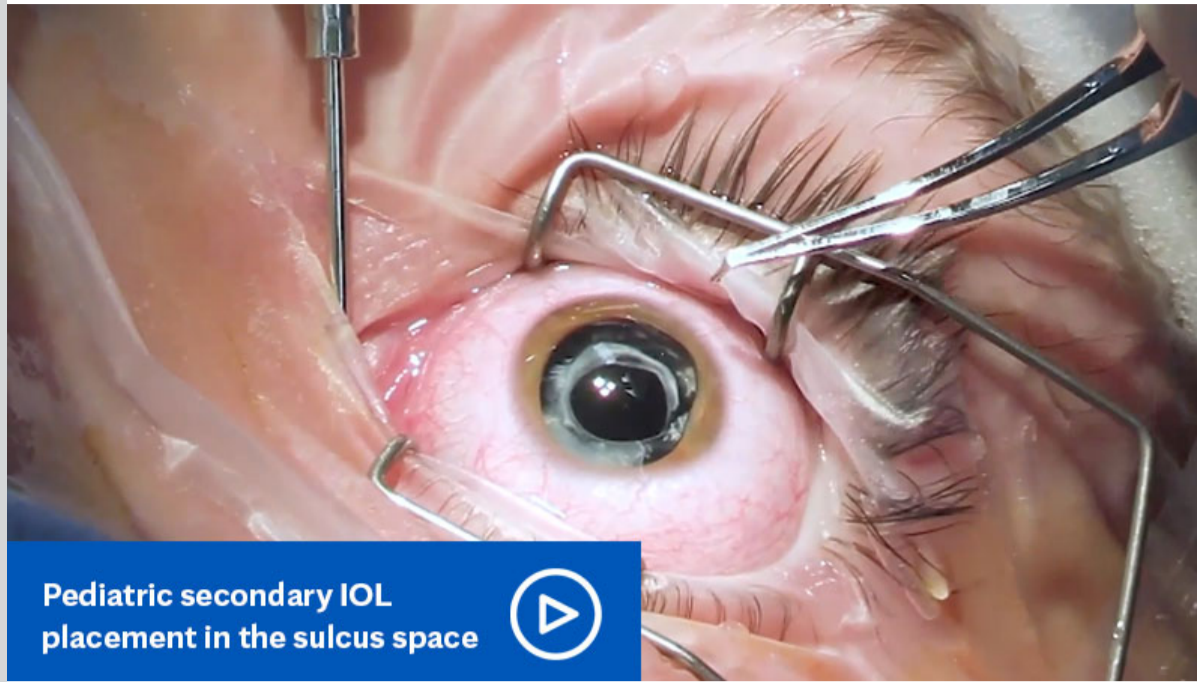
Pediatric secondary IOL placement in the sulcus space