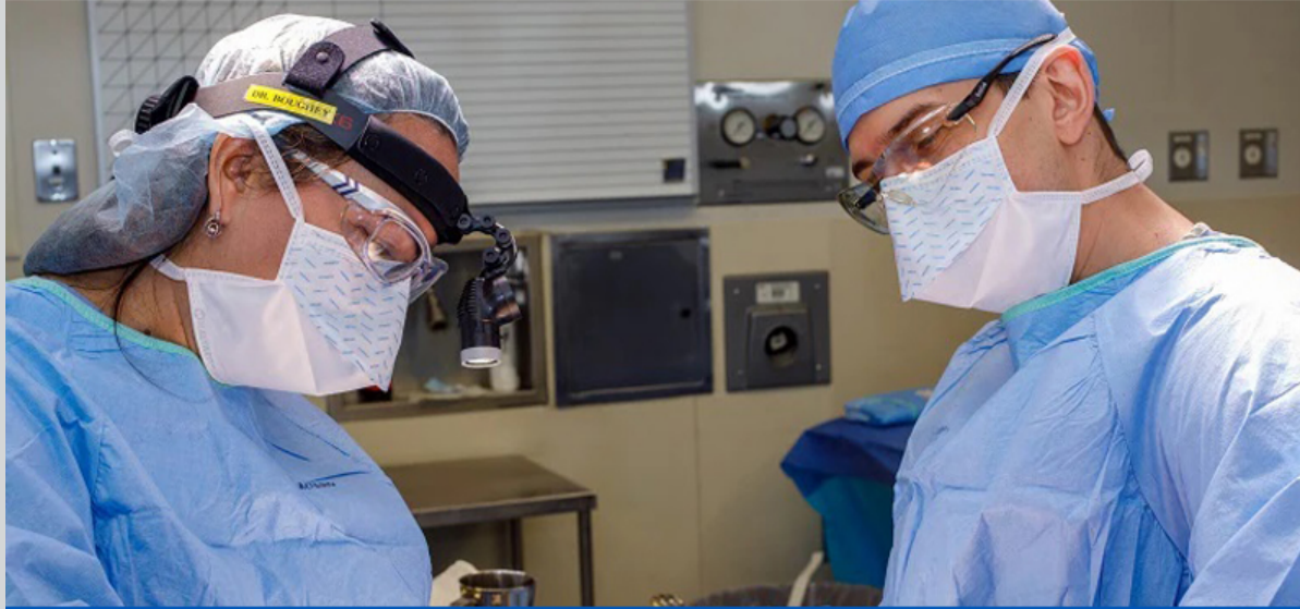
Breast-conserving surgery for multiple ipsilateral breast cancer