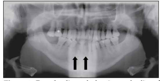
Figure 2. Dental radiograph showing nonhealing of extraction sites (arrows) in the anterior mandible—findings consistent with jaw osteonecrosis in this patient, who was treated with monthly intravenous bisphosphonate therapy.

Dr Koka explains: "No randomized clinical trials have been published describing interventions to prevent or treat jaw osteonecrosis. Patients should have potentially traumatic dental treatment, such as tooth extractions, root canals, or dental implantations, before starting oral or intravenous bisphosphonate therapy. The optimal time for withdrawal of bisphosphonates before dental surgery in patients already taking bisphosphonate therapy is not yet established, but most specialists advocate withdrawal of therapy 3 months before dental surgery. Nevertheless, the risks and benefits from this form of 'drug holiday' are as yet unproven, particularly because bisphosphonates have a long half-life of several years in the skeleton. It is suggested, however, that if a dental extraction or other form of dental surgery is necessary, a course of pretreatment and posttreatment antibiotics-from 1 day before to 7 days after surgery—be used because this course may reduce the risk of osteonecrosis of the jaw. Encouragingly, retrospective analyses indicate that dental implants placed in individuals receiving bisphosphonate therapy for osteoporosis or osteopenia are successful."