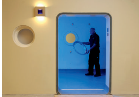
Far left, a smaller version of hyperbaric chamber designed for individual treatments will also be available for patients. Left, finishing touches are being made to the interior of the large chamber.

Funds were allocated to hire and train staff devoted to creating what Dr. Claus describes as an atmosphere of healing. The space houses the hyperbaric chamber, patient dressing rooms, and four wound care exam and treatment rooms.