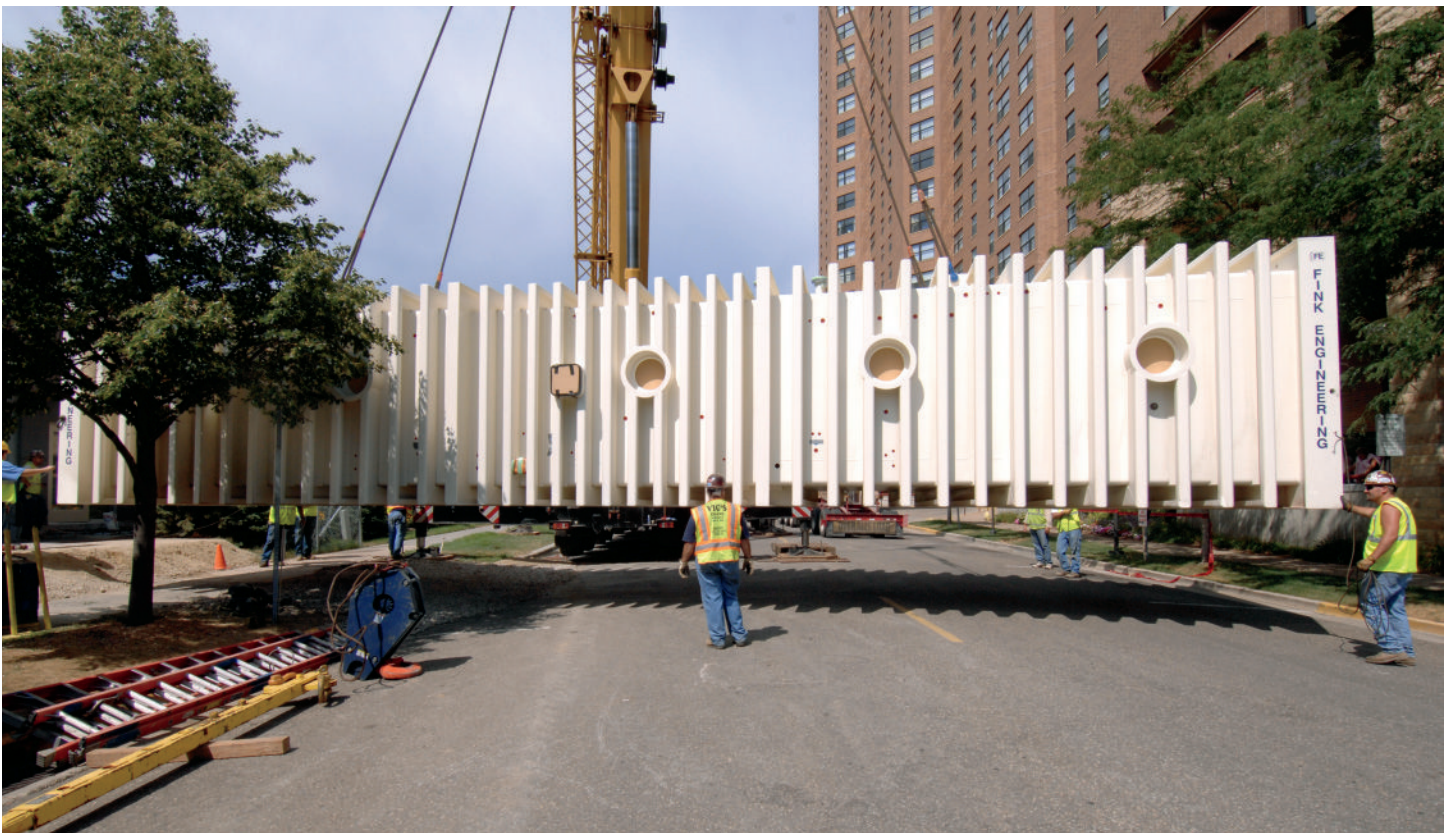
The 3,800-square-foot hyperbaric chamber — the hallmark of Mayo Clinic's new Hyperbaric Medicine Program — was installed in the Charlton Building. The 24-patient chamber will provide limb-saving, tissue-saving and lifesaving treatment with hyperbaric oxygen therapy. The chamber also will be used for altitude research and development.