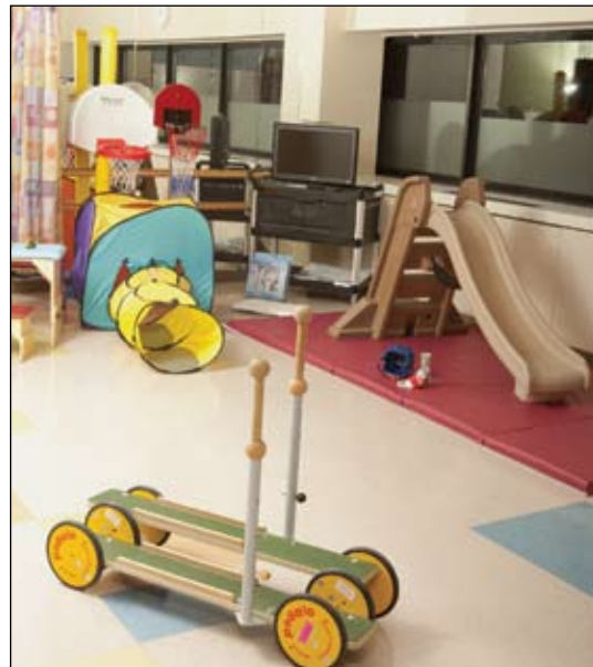
Pediatric treatment spaces are designed to meet the unique needs of children. Dedicated pediatric rooms have optimally sized features and aesthetics for children.