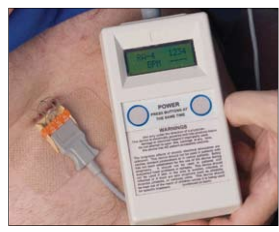
Figure. An external electronic stimulator is attached via wires through the skin to 4 electrodes implanted in the diaphragm near the phrenic nerves. The device generates an electric impulse that triggers the diaphragm to contract and allows air to fill the upper and lower parts of the lungs.

Dr Reeves's team reports that 2 SCI patients have undergone device implantation at Mayo Clinic thus far. During the first month following implantation, one of these patients was able to stay off the ventilator for up to 8 hours a day, while the other was off the ventilator for 2 to 3 hours at a time. Dr