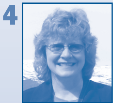
Melanoma Survivor Takes Prevention Seriously