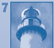
Navigator Notes: Finding Help