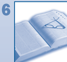
Cancer Terms & Resources