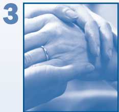
Social Work: An Integral Part of Caring