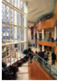
Gonda Building Atrium Mayo Clinic, Rochester, Minn.