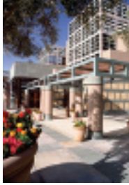
Mayo Clinic Building, Scottsdale, Ariz.

In an executive's world, there never seem to be enough hours in a day to get work done. Health concerns, as a result, often fall to the end of one's to-do list.