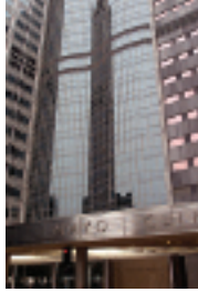
Gonda Building Mayo Clinic, Rochester, Minn.

An executive's health is vital to everyday job performance, to long-range career and company planning and, above all, to one's quality of life.