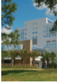
Davis Building Mayo Clinic, Jacksonville, Fla.